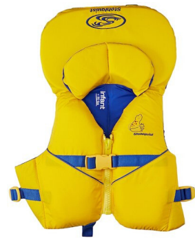
Infant Life Vest TYPE 2