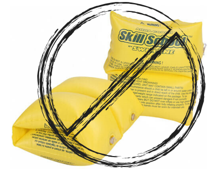
Water Wings/ Arm Floaties