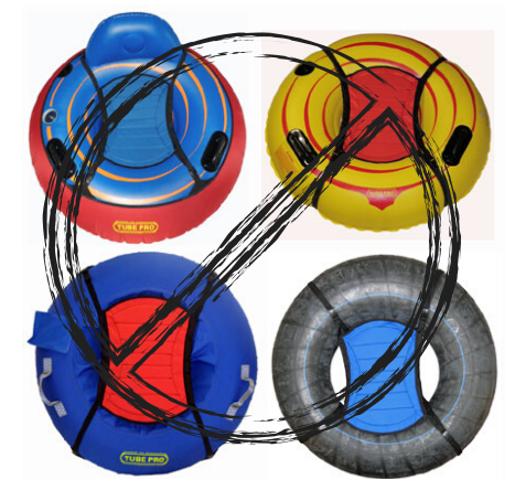
Inner Tubes with Seats