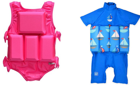
Flotation Swim Suits TYPE 3