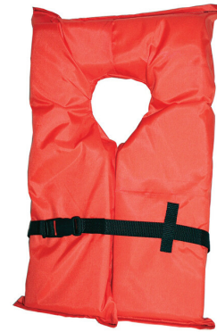
Basic Life Vest TYPE 2