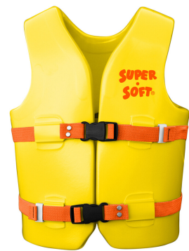
Children's Life Vest TYPE 2