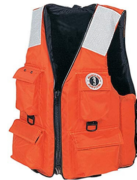
Standard Life Vest TYPE 2