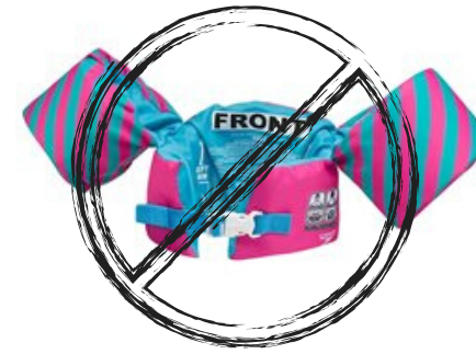
Water Wings with Belts